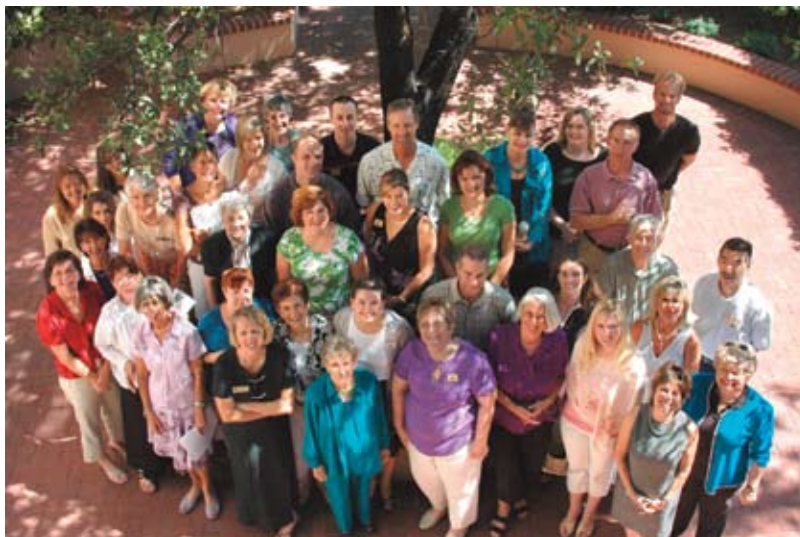
Long agents join forces to make a difference through the Long Cares Foundation.