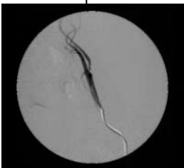
This left internal carotid artery was severely blocked before treatment.

Ten patients have been enrolled at UMC in the CREST study so far. As participation in this leading-edge study grows, Mills and the vascular surgery team will learn more about the best techniques for preventing stroke in you and your family. ■